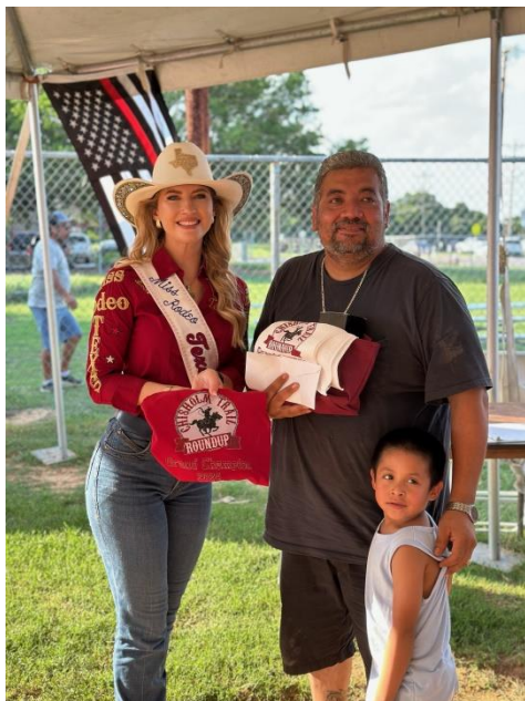
Miss Tx. Rdeo